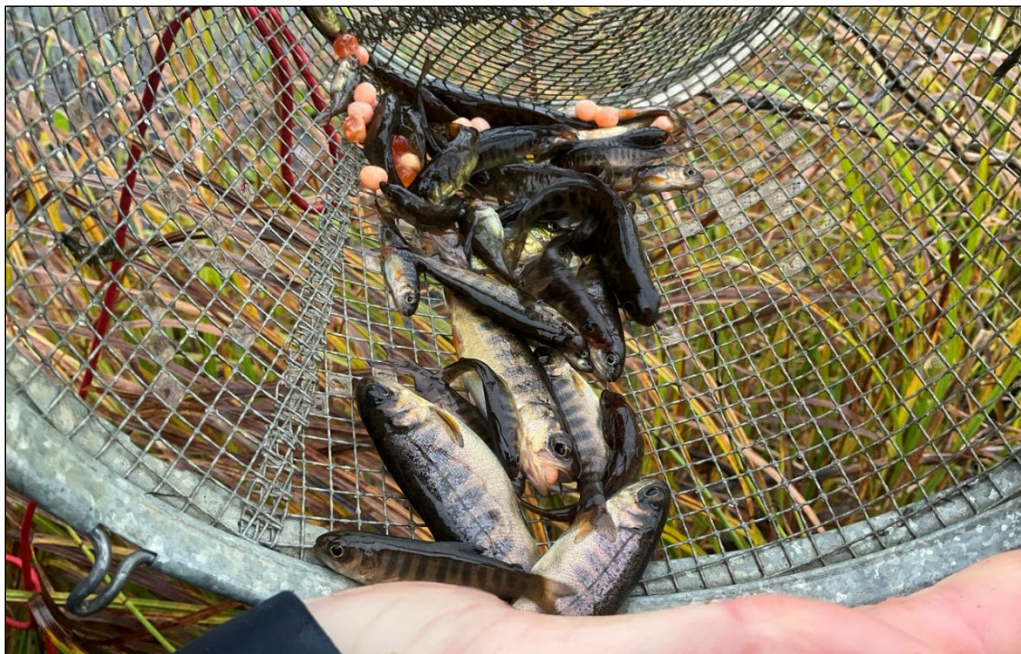
Figure 1.—Juvenile coho at waypoint 1237.