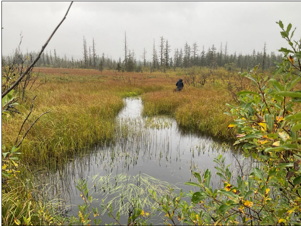
Figure 3.—Stream channel upstream of the road.