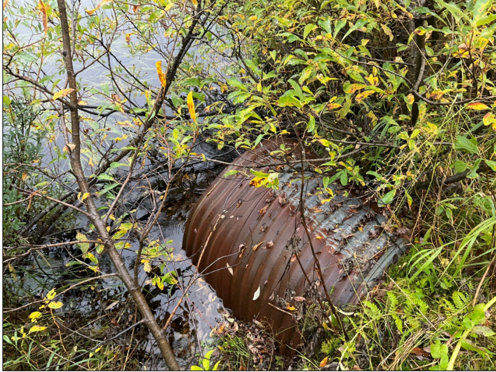
Figure 2.—Inlet of culvert at waypoint 1237.